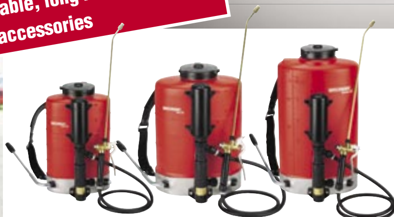
Flox 10 l